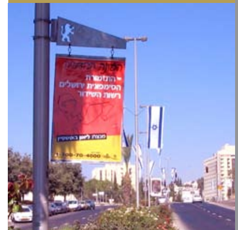
Botstein takes to the streets